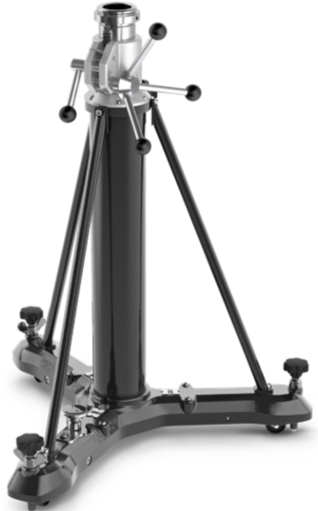
L-107 Instrument Stand