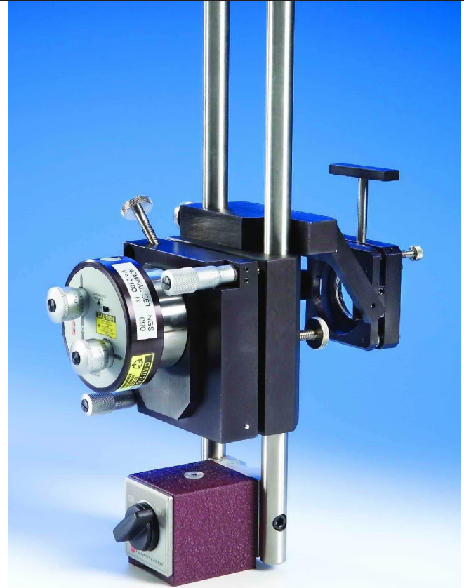
L-706 in L-111 Laser Stand and L-102 Beam Translator