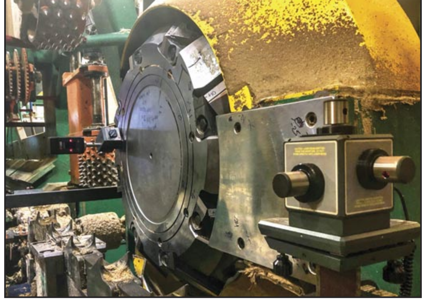
Aligning canter heads and anvils for lead, plumb and offset using the L-743 triple scan laser and A-1519-2.4ZB Wireless Targets. Below, at left, aligning track and rolls of secondary breakdown line; right, aligning bed and press rolls parallel and level on secondary breakdown