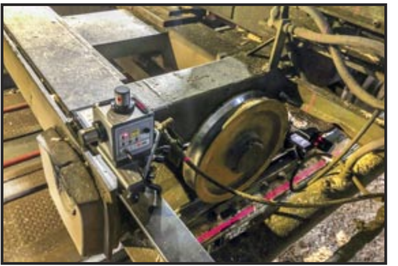
Aligning log carriage track and knees

specific results will differ from mill to mill, many of Reed's customers have shared with him significant improvements in recovery, as well as saw blade deviation and other machine parameters after laser alignments. Depending on the size of the mill, even relatively small improvements in recovery can have a big impact on profitability.